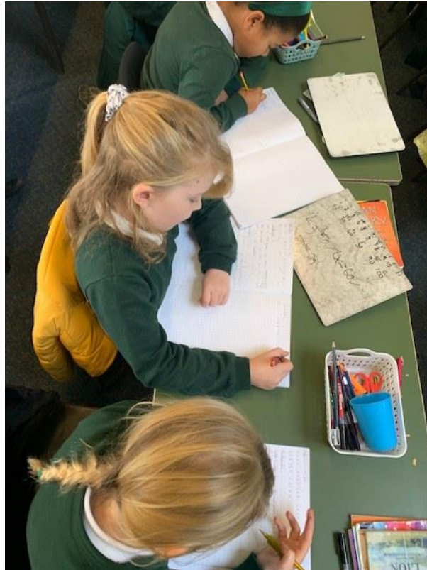
1 - New Knowledge and Making it Stick!

Learning is the process of acquiring new knowledge, skills, or understanding through experience, study, or teaching. It leads to changes in behaviour, thoughts, or abilities.